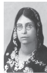
Sufia Kamal | 1911 – 1999 | Poet | Social Activist Women’s Organisation Founder

Woman barrister in Pakistan. Teacher at the Faculty of Law, Dhaka University. Co-Founder of Ain o Salish Kendra. Founding Trustee of BLAST. Founder of the Human Rights and Legal Service Programme of BRAC. Founding member of Women Living Under Muslim Laws. Public interest petitioner on women’s and worker’s rights. Author of publications on law and justice and women’s rights.