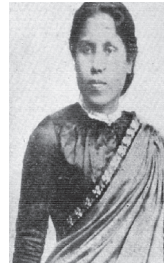
Kamini Roy | 1864 – 1933 | Writer | Campaigner for Voting Rights

Leader of the Tebhaga movement, Nachole, Chapai Nawabganj. Survivor of police torture. Mobiliser of public opinion and supported the Liberation War of 1971.