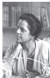
Noorjehan Murshid | 1924 – 2003 | Lawmaker

Elected member of the East Bengal Legislative Assembly, 1954 to 1958. Member of the Constituent Assembly of Bangladesh, 1972. Member of Parliament, 1972. State Minister of Women, Education, Sports and Cultural Affairs, 1974. Vice-President of the Mahila Samity.