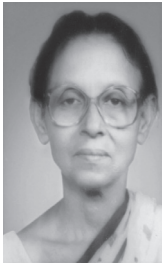
Ila Mitra | 1925-2002 | Organiser | Political Activist

Leader of the Tebhaga movement, Nachole, Chapai Nawabganj. Survivor of police torture. Mobiliser of public opinion and supported the Liberation War of 1971.