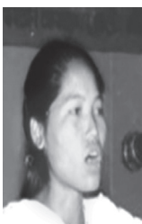
Kalpana Chakma | 1976 – missing from 1996 Organiser | Political Activist

Birangona. Vice President, Ekattorer Ghatok Dalal Nirmul Committee. Recipient of the Independence Day Award, 2010.