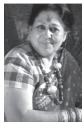
Ferdousi Priyabhashini | 1947 – 2018 | Campaigner Survivor

Woman lawyer in the Dhaka High Court in the 1960s. Woman notary public in Bangladesh. Founding member of the Bangladesh National Women’s Lawyers’ Association.