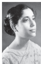
Jahanara Imam | 1929 – 1994 | Campaigner Teacher | Writer

Organising Secretary of the Hill Women’s Federation, Rangamati, Chittagong Hill Tracts. Allegedly abducted on 12 June 1996 from her home at Lallyaghona village, Rangamati.