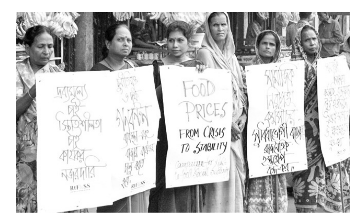
© RtF&SS: Campaign for Right to Food & Social Security

The campaign aims to ensure participation concerned organizations individuals across Bangladesh who are committed to work towards establishing people's fundamental entitlements. This includes the right to food and social security as necessary for establishing a life free from hunger, malnutrition, and poverty, and essential for human dignity. More specifically, the campaign aims to voice the needs of individuals in order to increase effective implementation, distribution, and monitoring of Social Safety Net Programmes; to demand proper implementation of the Public Distribution System; to seek action against food syndicates and illegal hoarding of food grains in the market; to monitor corruption within safety net distribution using the Right to Information Act; to advocate for policy and legal reforms related to securing right to food, social security, and disaster responses; and to undertake appropriate legal action, including public interest litigation, to secure the right to food and social security.